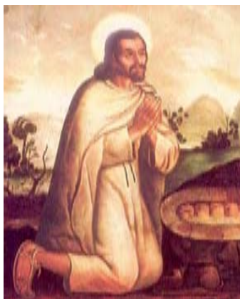
St. Juan Diego