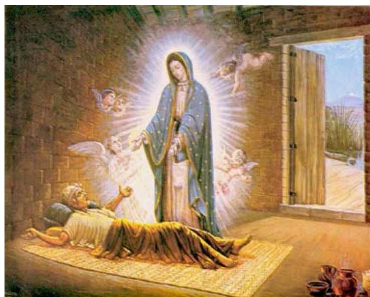
The cure of Juan Bernardino

Juan Diego's uncle Juan Bernardino was in fact cured of his disease at that very moment. Our Lady told Juan Bernardino that she wished to be known under the title, "Santa Maria Te-coa-tla-xope". In the Aztec language "Coa" meaning serpent, "tla" being the noun ending which can be interpreted as "the", while "xopeuh" means to crush or stamp out. He later told this word to the Spaniards, who heard it as "de Guadalupe", a devotion to the Blessed Mother in Extremadura, Spain that the Spanish were very familiar with. (see p.5) (This is how the image was named Guadalupe, a title which it has kept for over four centuries.) But in reality it would seem that Our Lady must have called Herself "Santa Maria who crushes the serpent."