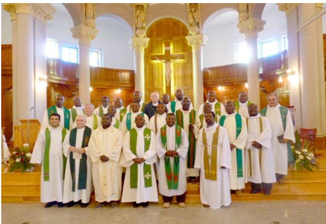
Bishops and priests who came to our seminar in Rougemont, Quebec, Canada, in September of 2010

When the Virgin Mary appeared to Juan Diego in 1531, she had her children of the 20th Century in mind. Some of the signs on the tilma have only been discovered because of the modern technology of today. Recently it was discovered that there are at least 13 people reflected in the eyes of the Virgin. Among them is a mother carrying her baby on her back. In these times today where the family is under such attack from so many different dimensions, and babies are being destroyed by millions in their mother’s wombs in abortion mills, this is a very significant find!