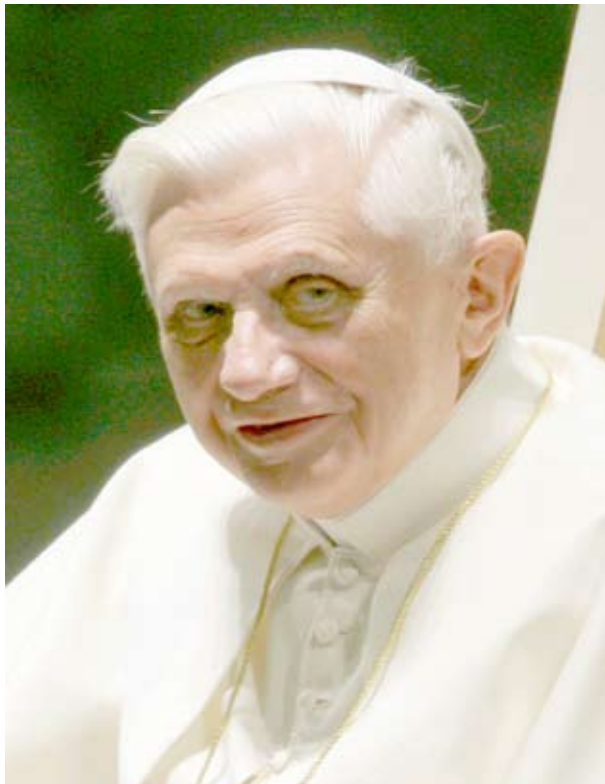
Pope Benedict XVI gives his homily

Man has an unmistakable originality compared to all other living beings that inhabit the earth. He presents himself as a unique and singular entity, endowed with intelligence and free will, as well as being composed of a material reality. He lives simultaneously and inseparably in the spiritual dimension and the corporal dimension. This is also suggested in the text of the First letter to the Thessalonians which was just proclaimed: "May the God of peace himself – St. Paul writes – make you perfectly holy