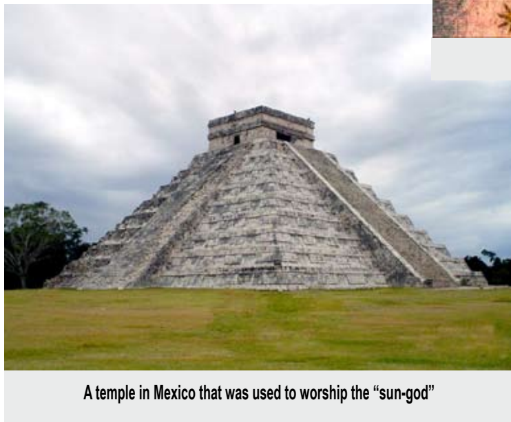
A temple in Mexico that was used to worship the “sun-god”

Upon entering the city, Juan Diego went directly to the Bishop’s palace to meet with Bishop Juan de Zumarraga, a Franciscan of great piety who had a great love for the Virgin Mary. Juan related to him all that he had seen and heard. The Bishop was cordial