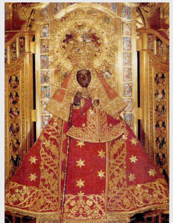
The Virgin of Guadalupe

It would be of interest to also note here the names of his (Christopher Columbus') three ships; the "Pinta," the "Nina," and the "Santa Maria." The Spanish word "Pinta" is a derivative of the verb "pintar" meaning to "paint," "Nina" means "young girl," and "Santa Maria" is "Holy Mary." To put these three words together we can literally say that: He (God) paints the young girl, Holy Mary. These were the three ships that Columbus and his men sailed when they came to discover the New World, and it seems to prefigure the apparition of Our Lady to Juan Diego in 1531 on the hills of Tepeyac, outside of Mexico City where she left her image "painted" on his tilma.