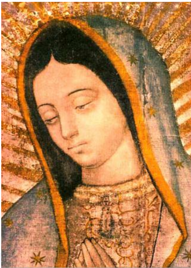
The miraculous image of Our Lady