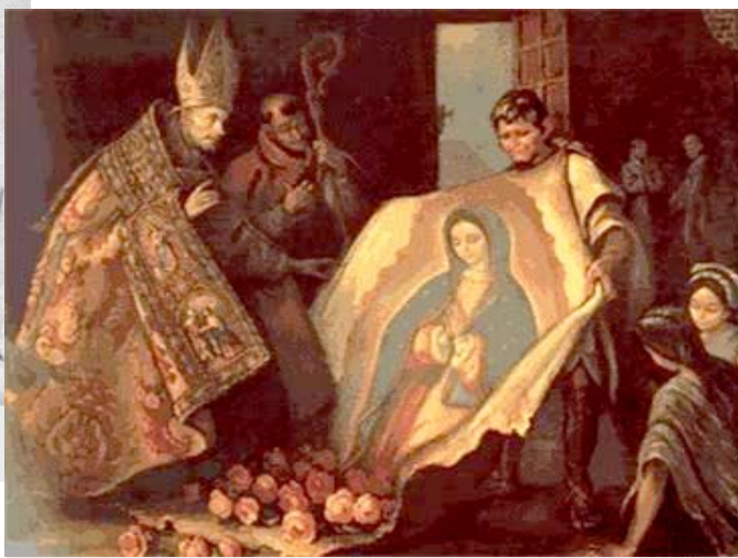
Roses spilling from the tilma of St. Juan Diego

When Juan Diego was told that his uncle was cured, he was greatly consoled and begged the Lady from Heaven to excuse him so that he could now go directly to the Bishop in order to bring him Her "sign" that he too could now believe. The Lady from Heaven ordered him: "Climb, My son the least, to the top of the hill where you saw Me and I gave you orders. You will find different flowers. Cut them, gather them, assemble them, and then come and bring them before My presence."