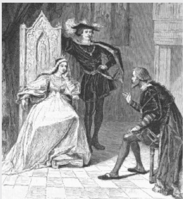
Queen Isabella and Christopher Columbus