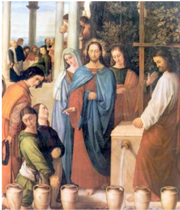
The wedding feast at Cana

All these signs prompted them to place themselves under the protection of her maternal mantle.